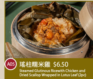
A05 瑤柱糯米雞 $6.50 Steamed Glutinous Rice with Chicken and Dried Scallop Wrapped in Lotus Leaf (2pc)