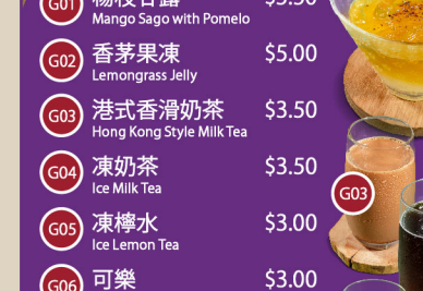
G03 港式香滑奶茶 $3.50 Hong Kong Style Milk Tea