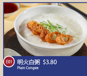
E01 明火白粥 $3.80 Plain Congee