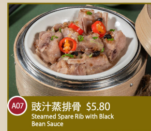
A07 豉汁蒸排骨 $5.80 Steamed Spare Rib with Black Bean Sauce