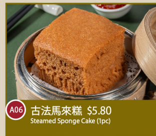
A06 古法馬來糕 $5.80 Steamed Sponge Cake (1pc)