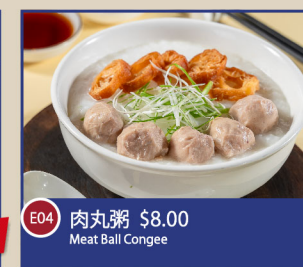
E04 肉丸粥 $8.00 Meat Ball Congee