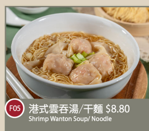
F05 港式雲吞湯/干麵 $8.80 Shrimp Wonton Soup/ Noodle