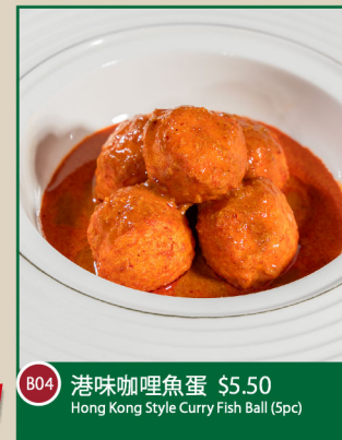
B04 港味咖喱魚蛋 $5.50 Hong Kong Style Curry Fish Ball (5pc)