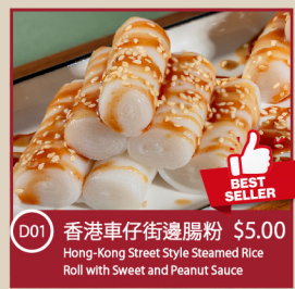
D01 香港車仔街邊腸粉 $5.00 Hong-Kong Street Style Steamed Rice Roll with Sweet and Peanut Sauce BEST SELLER