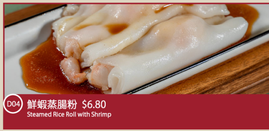
D04 鮮蝦蒸腸粉 $6.80 Steamed Rice Roll with Shrimp