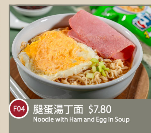
F04 腿蛋湯丁面 $7.80 Noodle with Ham and Egg in Soup