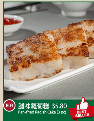
B03 臘味蘿蔔糕 $5.80 Pan-fried Radish Cake (3 pc) BEST SELLER