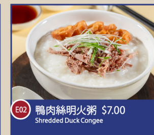
E02 鴨肉絲明火粥 $7.00 Shredded Duck Congee