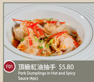
F01 頂級紅油抽手 $5.80 Pork Dumplings in Hot and Spicy Sauce (4pc)