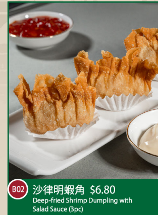
B02 沙律明蝦角 $6.80 Deep-fried Shrimp Dumpling with Salad Sauce (3pc)