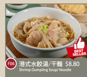
F06 港式水餃湯/干麵 $8.80 Shrimp Dumpling Soup/ Noodle BEST SELLER