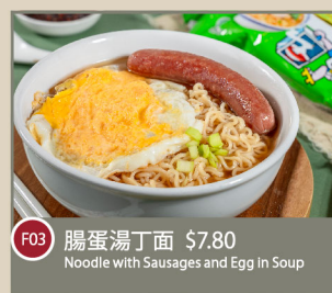
F03 腸蛋湯丁面 $7.80 Noodle with Sausages and Egg in Soup