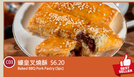
C03 蠔皇叉燒酥 $6.20 Baked BBQ Pork Pastry (3pc) BEST SELLER