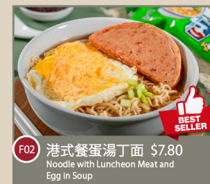
F02 港式餐蛋湯丁面 $7.80 Noodle with Luncheon Meat and Egg in Soup BEST SELLER