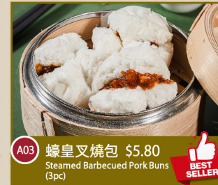
A03 蠔皇叉燒包 $5.80 Steamed Barbequed Pork Buns (3pc) BEST SELLER