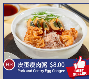
E03 皮蛋瘦肉粥 $8.00 Pork and Century Egg Congee BEST SELLER