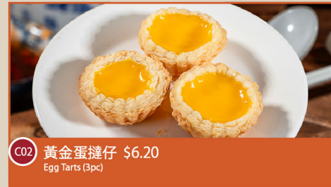
C02 黃金蛋撻仔 $6.20 Egg Tarts (3pc)