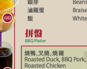
G04 凍奶茶 $3.50 Ice Milk Tea