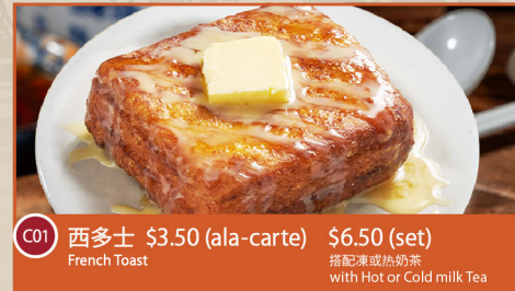
C01 西多士 $3.50 (ala-carte) $6.50 (set) French Toast 搭配凍或熱奶茶 with Hot or Cold milk Tea