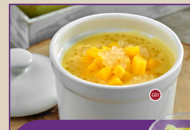
G01 楊枝甘露 $5.50 Mango Sago with Pomelo