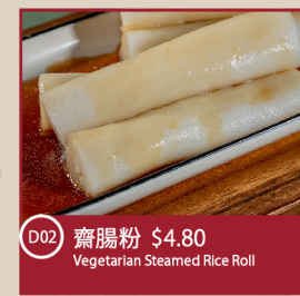
D02 齋腸粉 $4.80 Vegetarian Steamed Rice Roll