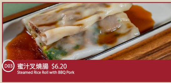
D03 蜜汁叉燒腸 $6.20 Steamed Rice Roll with BBQ Pork