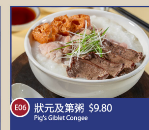
E06 狀元及第粥 $9.80 Pig's Giblet Congee