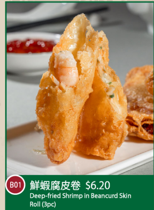
B01 鮮蝦腐皮卷 $6.20 Deep-fried Shrimp in Beancurd Skin Roll (3pc)