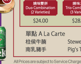
G06 可樂 $3.00 Coke