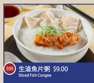
E05 生滾魚片粥 $9.00 Sliced Fish Congee