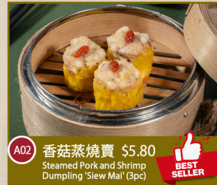
A02 香菇蒸燒賣 $5.80 Steamed Pork and Shrimp Dumpling 'Siew Mai' (3pc) BEST SELLER