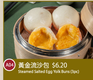
A04 黃金流沙包 $6.20 Steamed Salted Egg Yolk Buns (3pc)